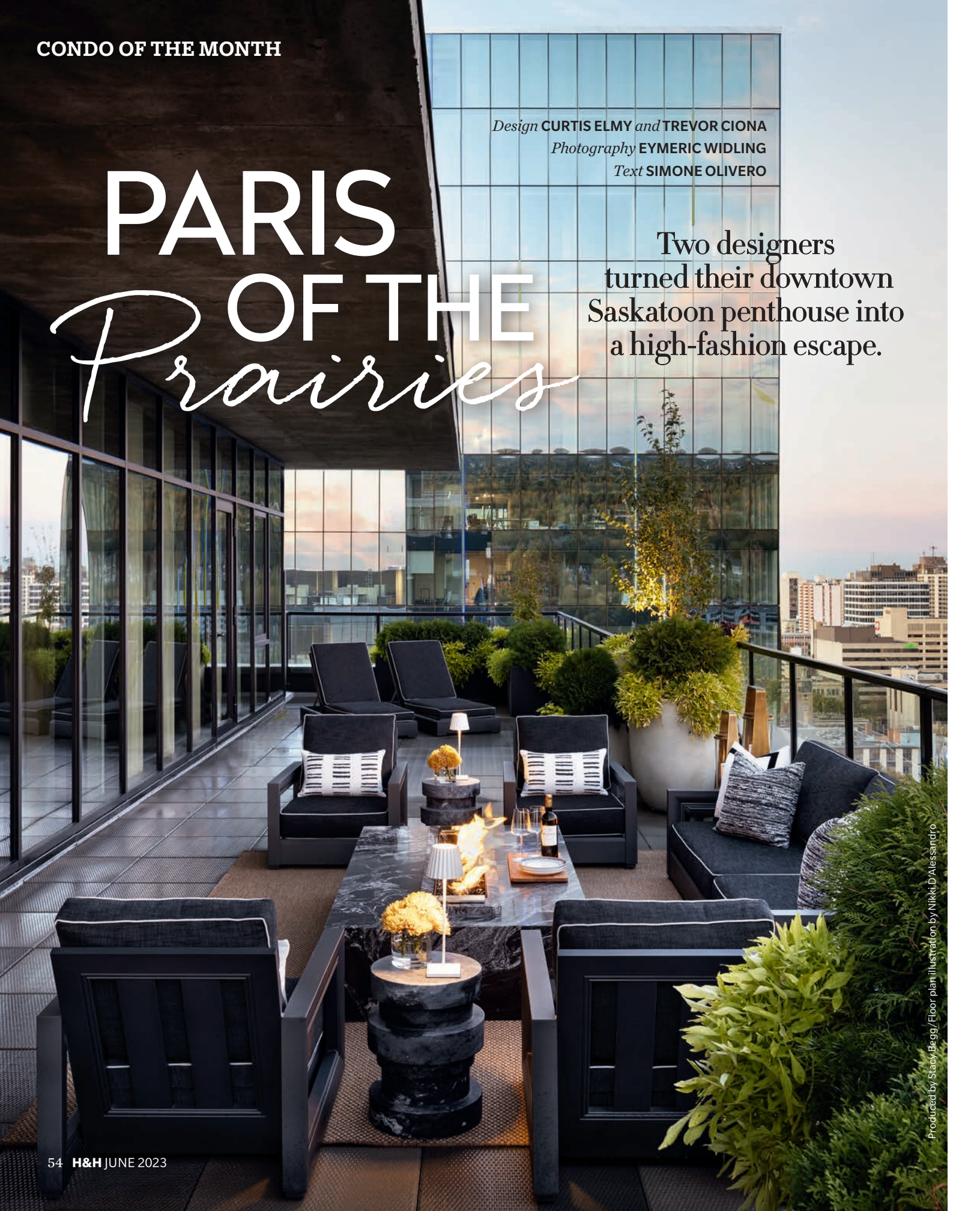
Produced by Stacy Begg/Floor plan illustration by Nikki D'Alessandro

Two designers turned their downtown Saskatoon penthouse into a high-fashion escape.