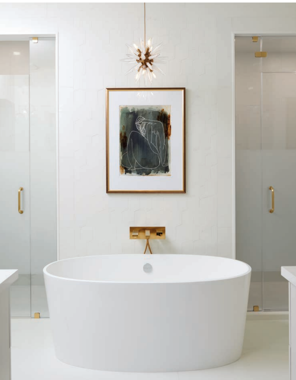
LEFT: The tub is the centerpiece of the luxurious ensuite. Pendant , John-Richard; tub by Victoria + Albert, PMF Plumbing Supplies; art , Denison Gallery.