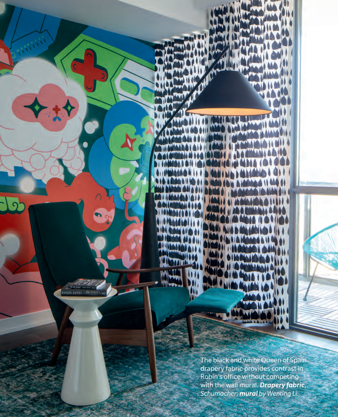
The black and white Queen of Spain drapery fabric provides contrast in Robin's office without competing with the wall mural. Drapery fabric , Schumacher; mural by Wenting Li.