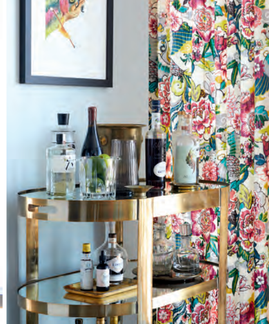
TOP RIGHT: A pretty bar cart in a brushed gold tone adds a hit of glamour. Bar cart , Union Lighting and Furnishings.