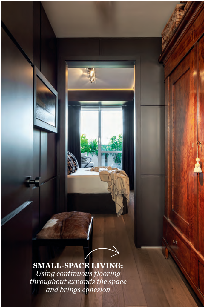
SMALL-SPACE LIVING: Using continuous flooring throughout expands the space and brings cohesion

“I’ve always liked dark, enveloping spaces in bedrooms. The room is very quiet and peaceful”