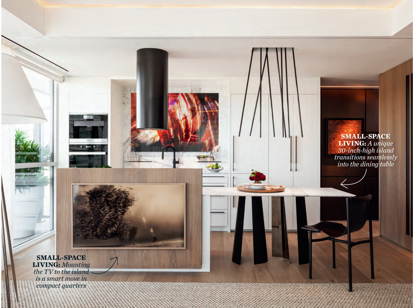
SMALL-SPACE LIVING: A unique 30-inch-high island transitions seamlessly into the dining table